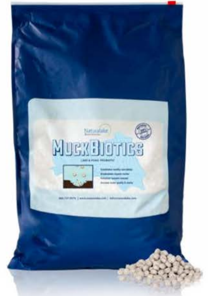
MuckBiotics are available in 30 pound biodegradable and resealable bags.